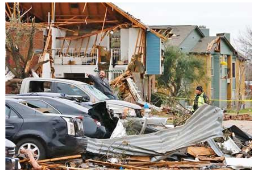
A homeowner tries to retrieve personal belongings from his neighborhood turned rubble heap after a string of tornados ripped through Garland, Texas, three days ago. A large weather system packing snow and heavy rain hit the mid-section of the US hard on the heels of extreme weather that claimed 43 lives in seven states.